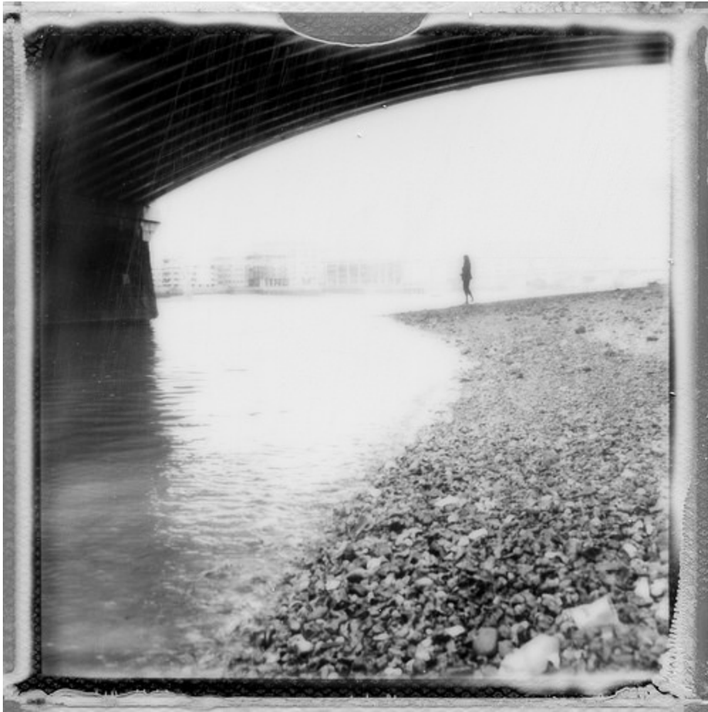
london, october 2014